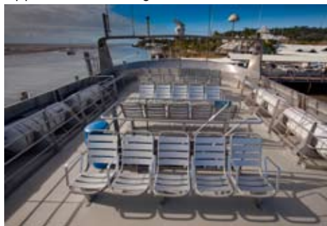
Outside, Sun Deck Seating