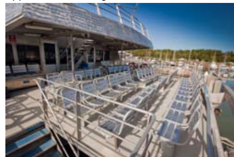
Outside, Upper Deck Seating