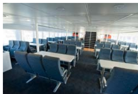
Forward Main Deck