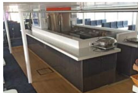
Main Deck Lunch Servery