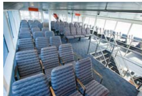
Upper Deck Seating