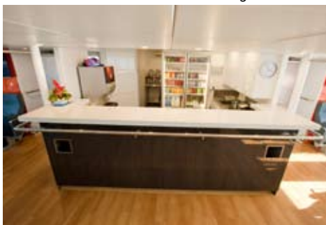
Main Deck Bar