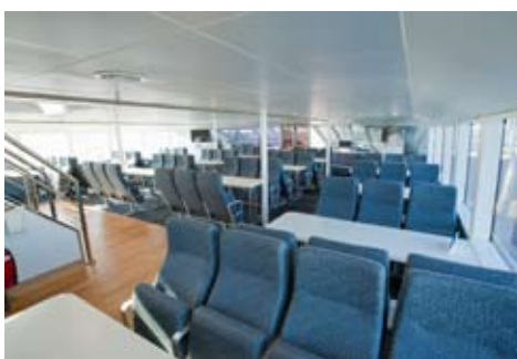
Main Deck Table & Chair Seating