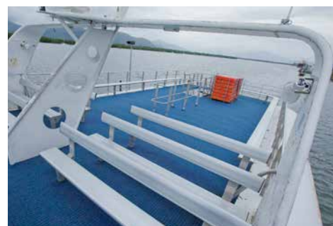
Outside, Sundeck Seating