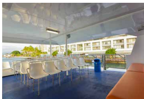
Outside, Aft Upper Deck Seating