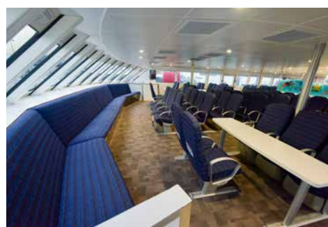
Main Deck Forward