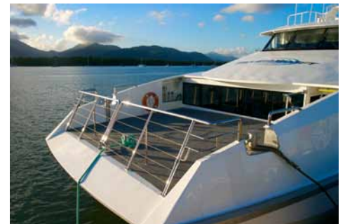
Outside, Forward Main Deck