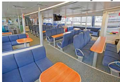
Main Deck Forward