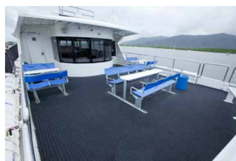
Outside, Aft Upper Deck