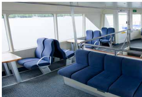
Upper Deck Table & Chair Arrangements + Lounge Seating