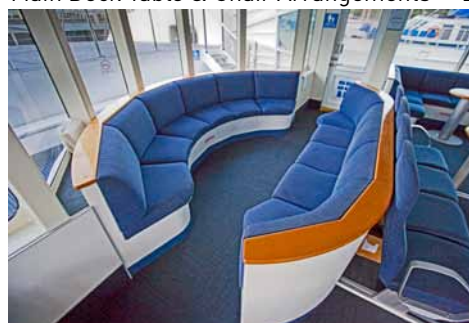
Main Deck, Lounge Seating