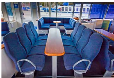
Main Deck Table & Chair Arrangements + Lounge Seating