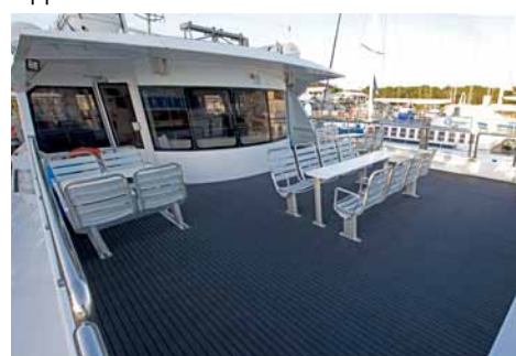
Outside, Aft Upper Deck